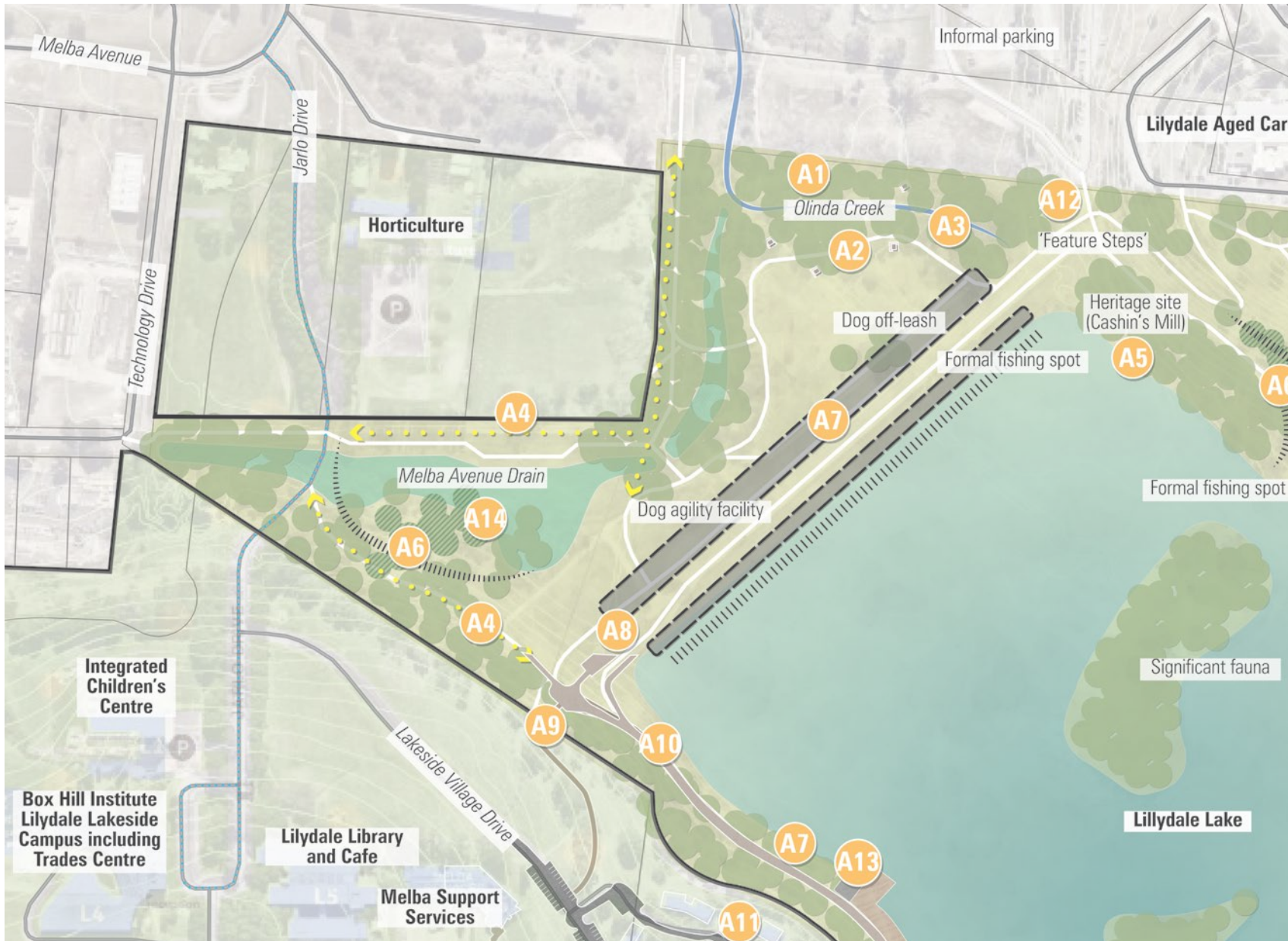
figure 2 Area A: North West