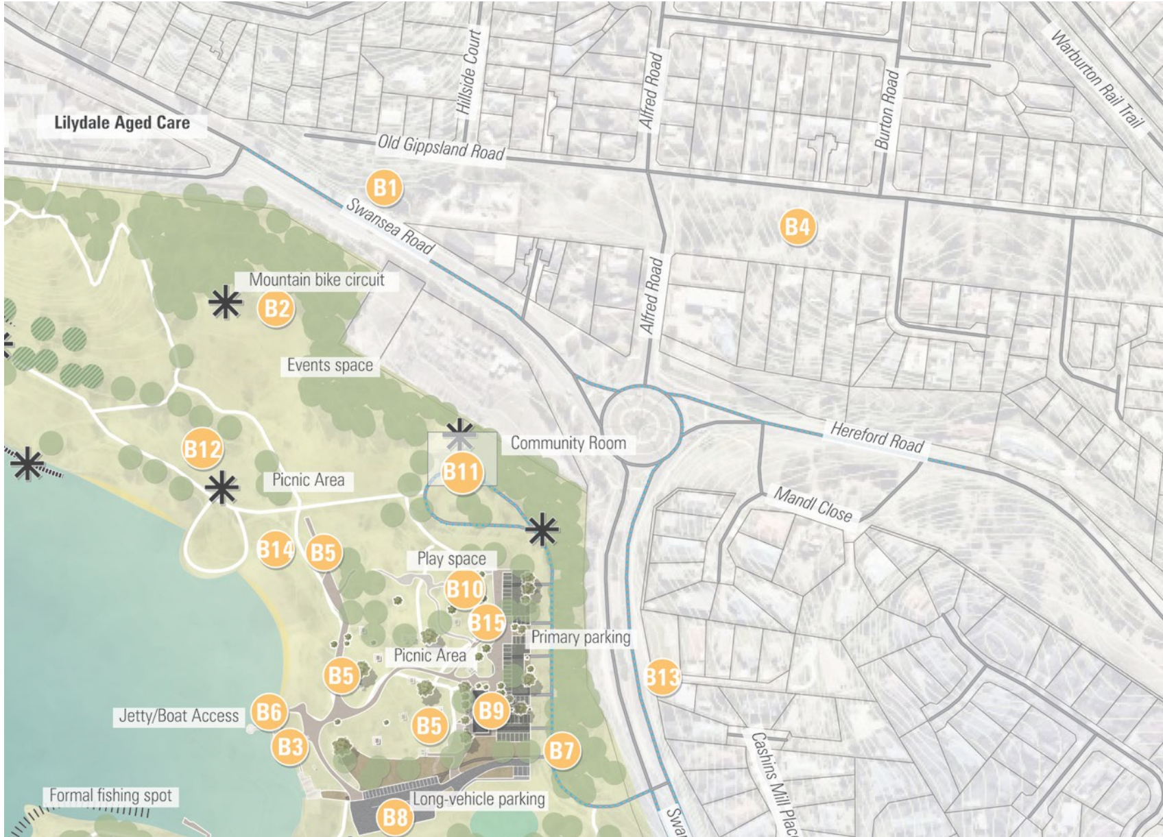
figure 3 Area B: North East