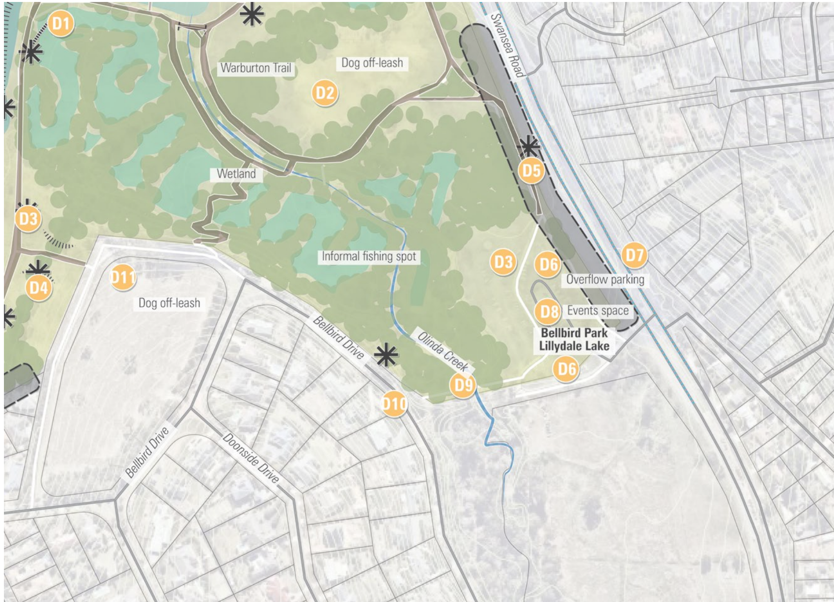
figure 5 Area D: South East