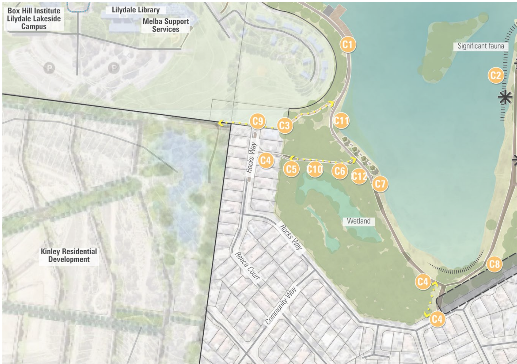
figure 4 Area C: South West